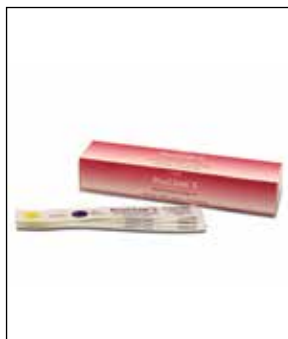
ProChek ® S Steam Sterilization Integrator