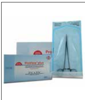
ProView ® plus Self Sealing Sterilization Pouch

Other products available from Certol include: