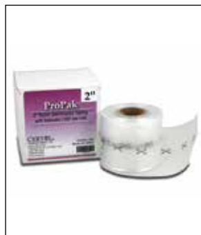
ProPak ™ Nylon Sterilization Tubing