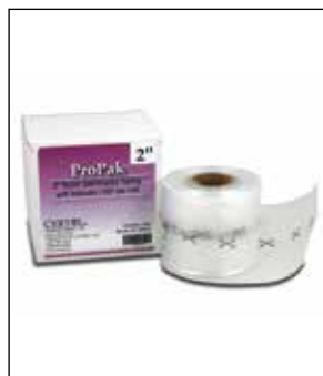
ProPak ™ Nylon Sterilization Tubing