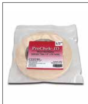
ProChek ® ID Indicator Tape