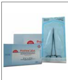
ProView ® plus Self Sealing Sterilization Pouch

Other products available from Certol include: