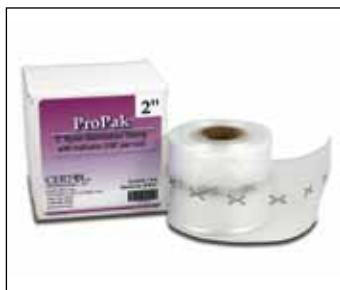
ProPak™ Nylon Sterilization Tubing

Other products available from Certol include: