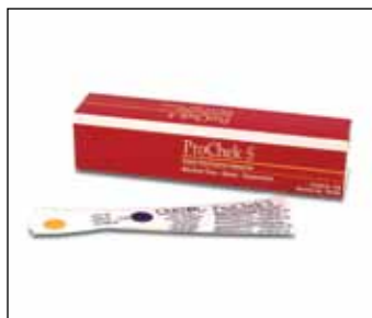
ProChek ® S Steam Sterilization Integrators