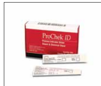
ProChek ® ID Indicator Strips for Steam and Chemical Vapor